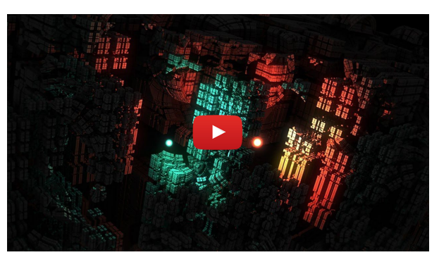
watch the trailer qb1.2